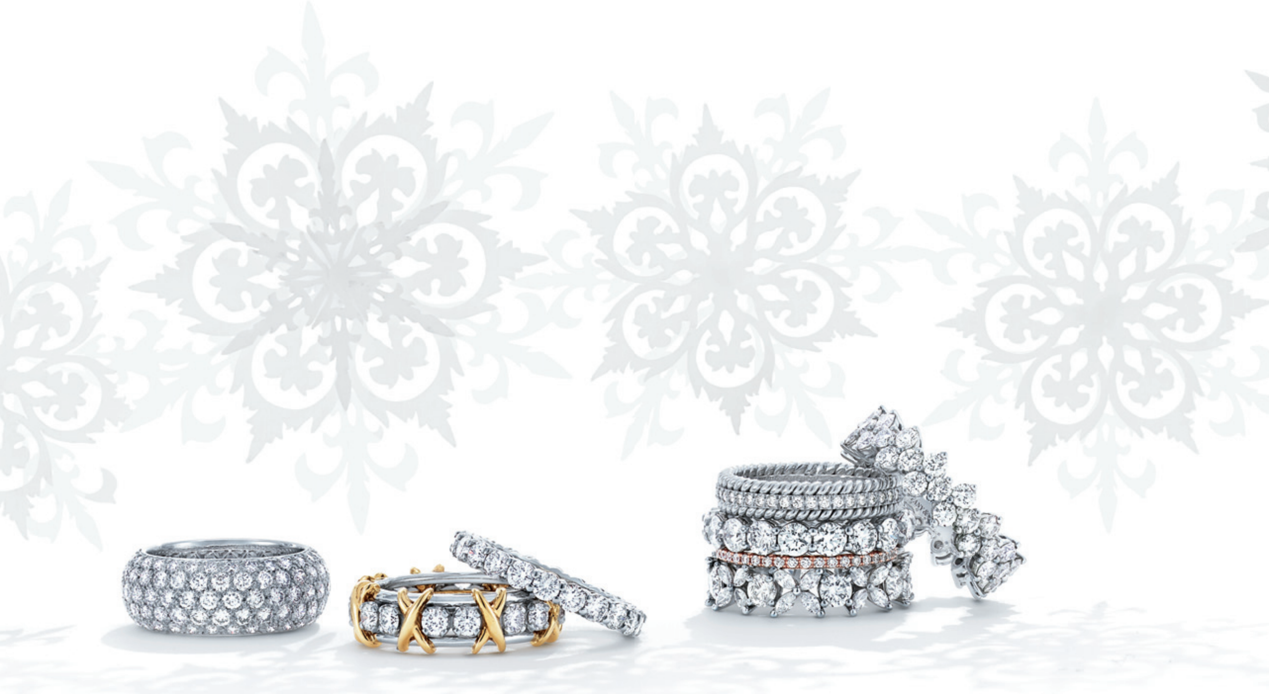
Tiffany Celebration® rings in platinum with diamonds, from left: Etoile five-row ring, from $16,275. Tiffany & Co. Schlumberger® Sixteen Stone ring with 18k gold, from $9,000. Shared-setting band ring, from $9,450. Tiffany Aria band ring, from $14,000. Tiffany & Co. Schlumberger® two-row rope ring, $5,300. Shared-setting band ring, from $15,525. Tiffany Metro ring in 18k rose gold, $2,200. Tiffany Victoria™ alternating band ring, from $13,900.