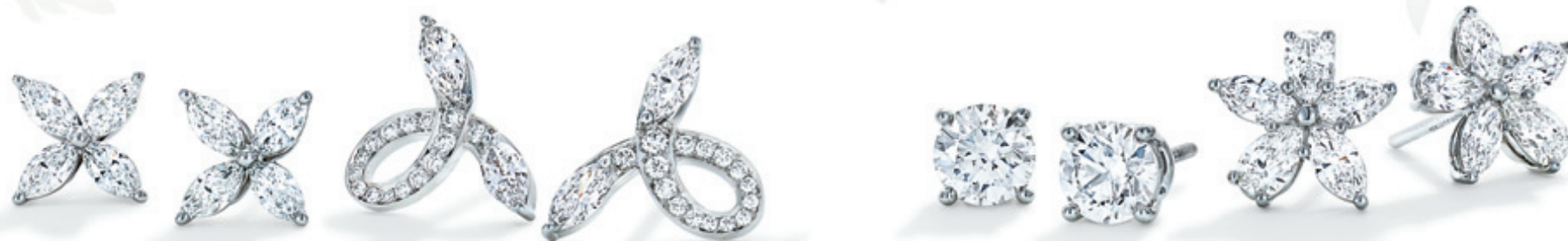
Earrings in platinum with diamonds, from left: Tiffany Victoria™, from $3,100. Tiffany Victoria™ bow, $8,800. Tiffany solitaire, from $1,940. Tiffany Victoria™ mixed cluster, from $8,500.