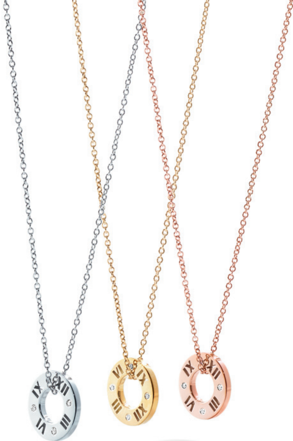
LEFT Atlas® pierced pendants with diamonds in 18k white, yellow and rose gold, $800 each.