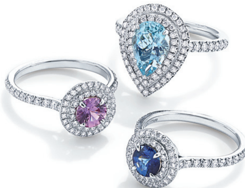
Tiffany Soleste® rings in platinum with round brilliant white diamonds, from left: Cushion-cut yellow diamond with 18k yellow gold, from $4,750. Round brilliant white diamond with pink diamonds and 18k rose gold, from $5,400. Pear-shaped tanzanite, $8,800. Round pink sapphire, from $7,500. Pear-shaped aquamarine, $8,400. Round sapphire, from $7,800.