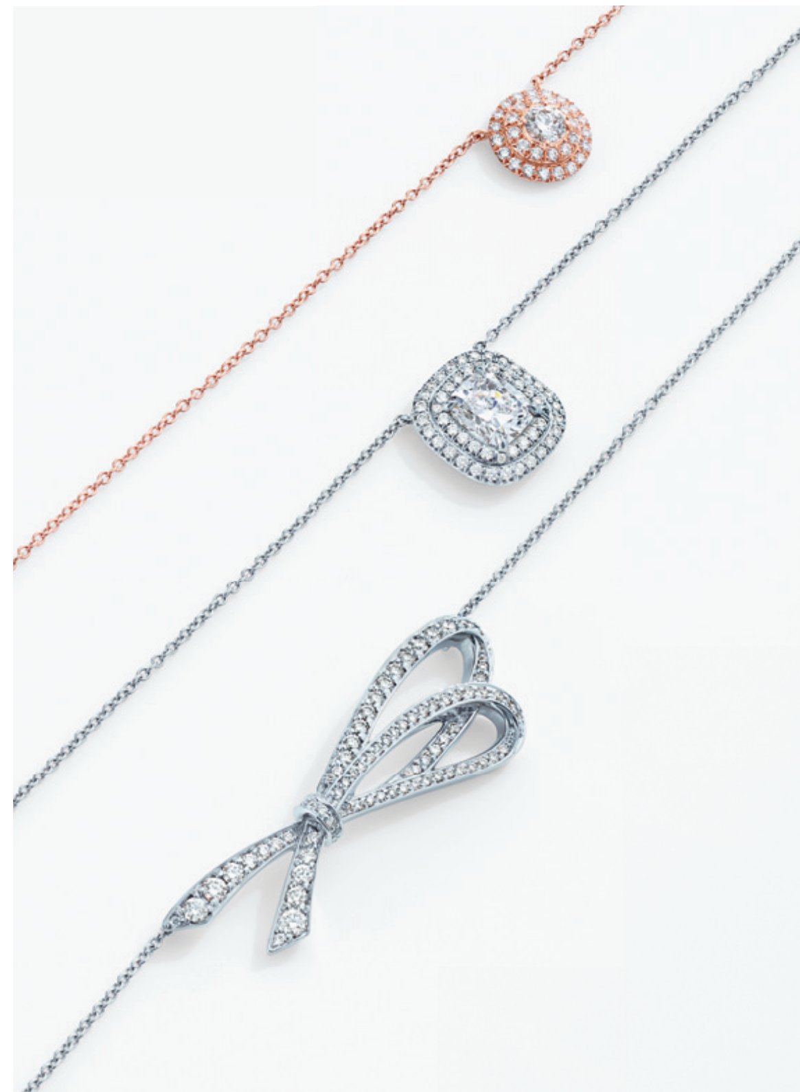
RIGHT Pendants with diamonds, from top: Tiffany Soleste® in 18k rose gold, $2,900. Tiffany Soleste® in platinum with diamonds, from $3,140. Tiffany Bow in 18k white gold, from $3,500.