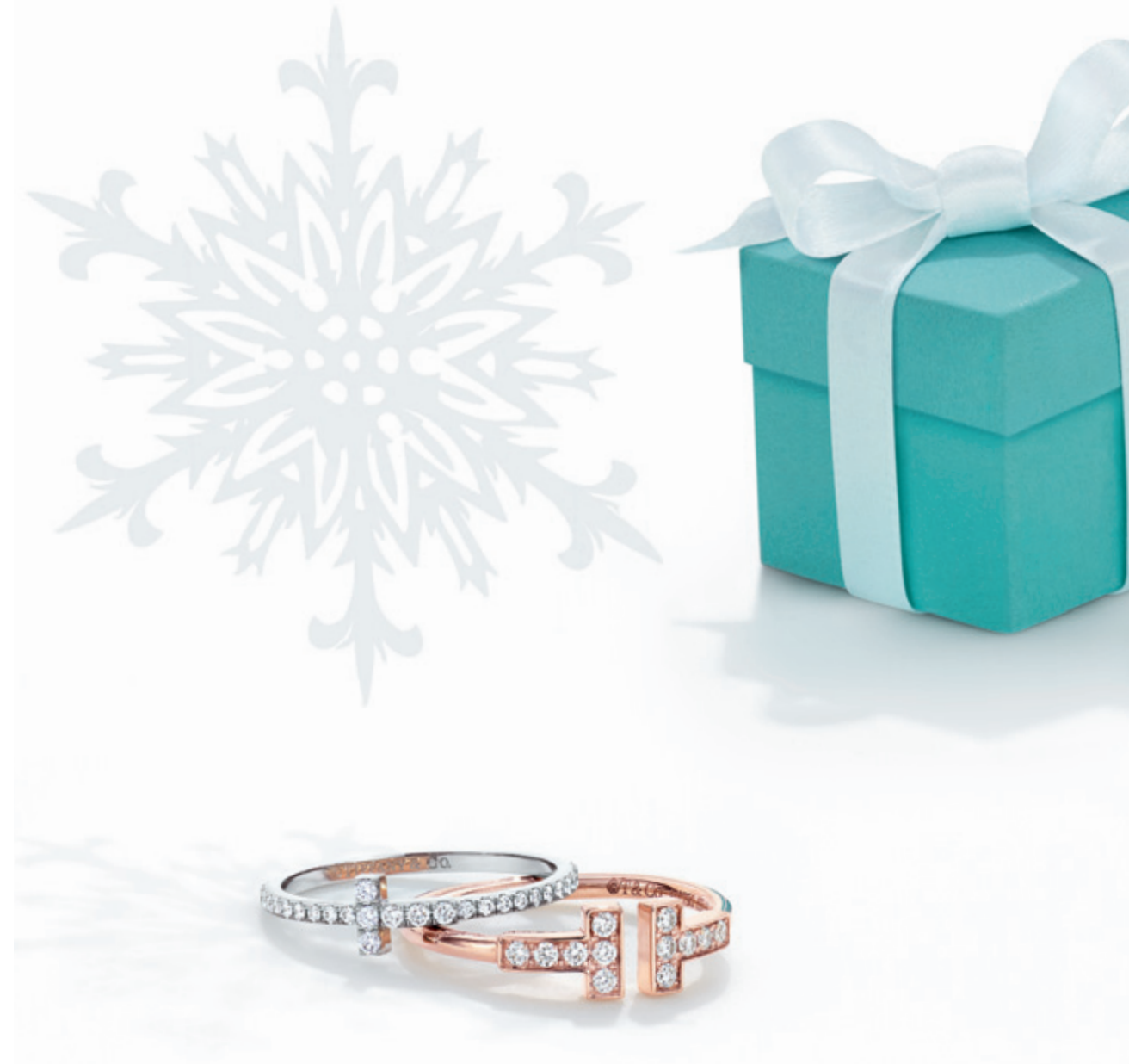
LEFT Tiffany T wire bracelets, from left: Narrow in 18k white gold, $1,200. In 18k rose gold with diamonds, $3,200. In 18k yellow gold with diamonds, $3,200. RIGHT Tiffany T wire rings with diamonds. In 18k white gold, $2,200. In 18k rose gold, $1,600.