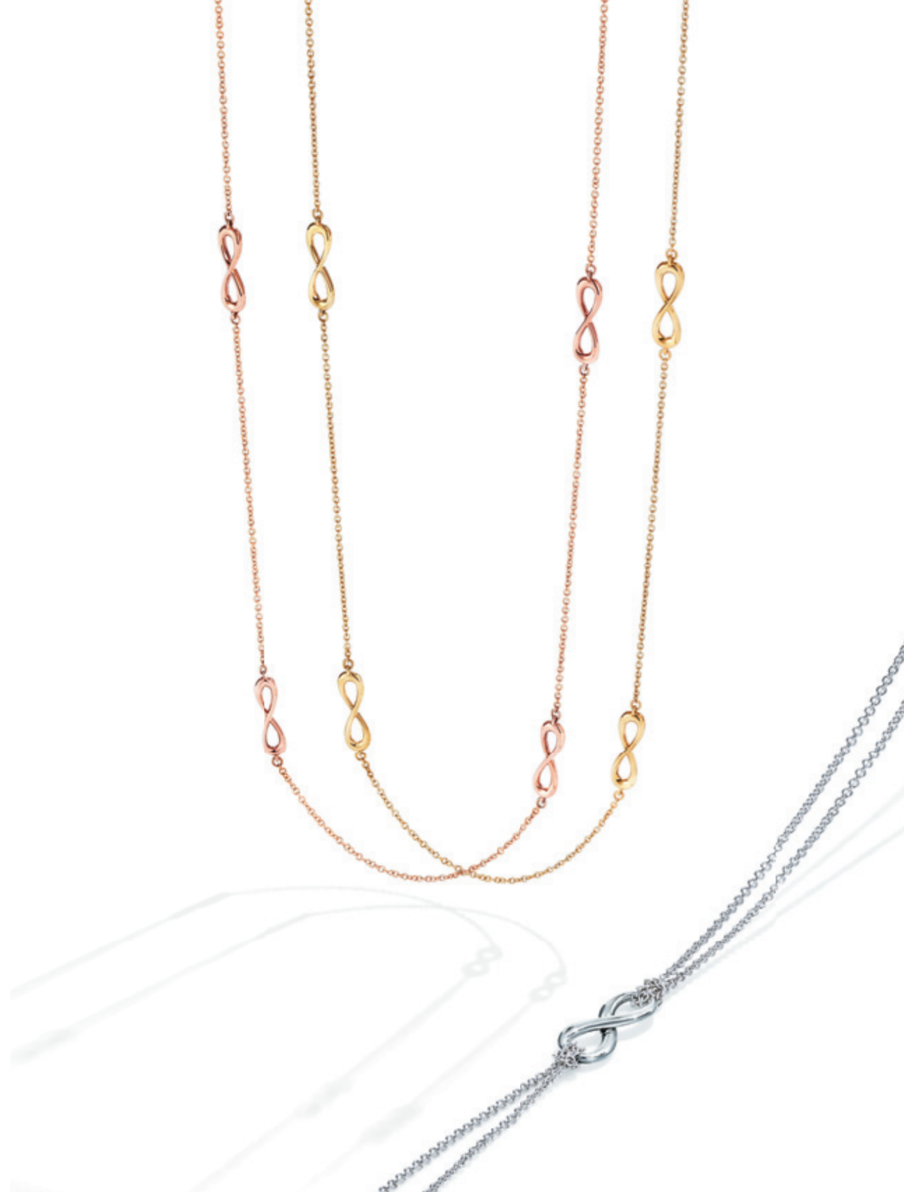
RIGHT Tiffany Infinity designs. Necklaces in 18k yellow and rose gold, from $975. Pendant in sterling silver, $250.