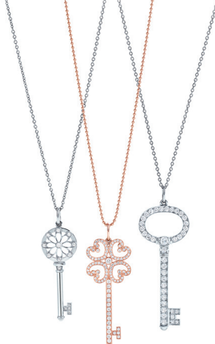
RIGHT Tiffany Keys pendants with diamonds, from left: Floral key in 18k white gold, $1,950. Quatra heart key in 18k rose gold, $4,600. Oval key in platinum, $4,000. Chains in 18k gold, from $225. Keys and chains sold separately.