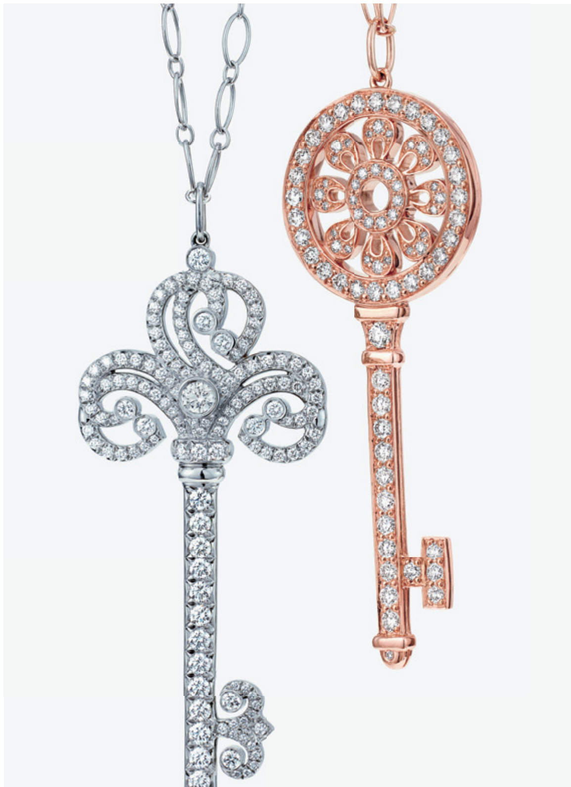
LEFT Tiffany Keys pendants with diamonds, from left: Tiffany Enchant® heart key in platinum, $10,500. Petals key in 18k rose gold, $8,300. Oval link chains in 18k gold, from $400. Keys and chains sold separately.