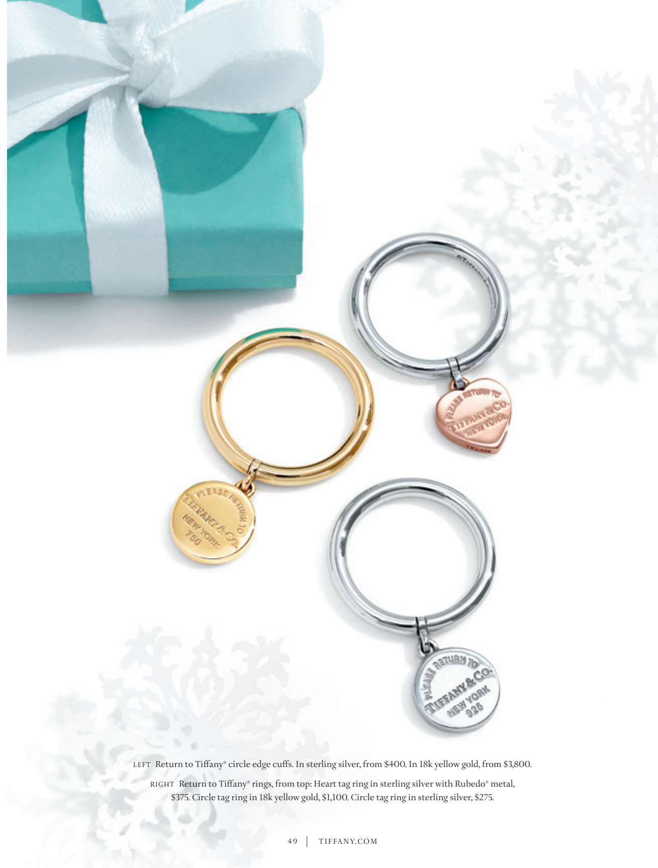
LEFT Return to Tiffany® circle edge cuffs. In sterling silver, from $400. In 18k yellow gold, from $3,800.