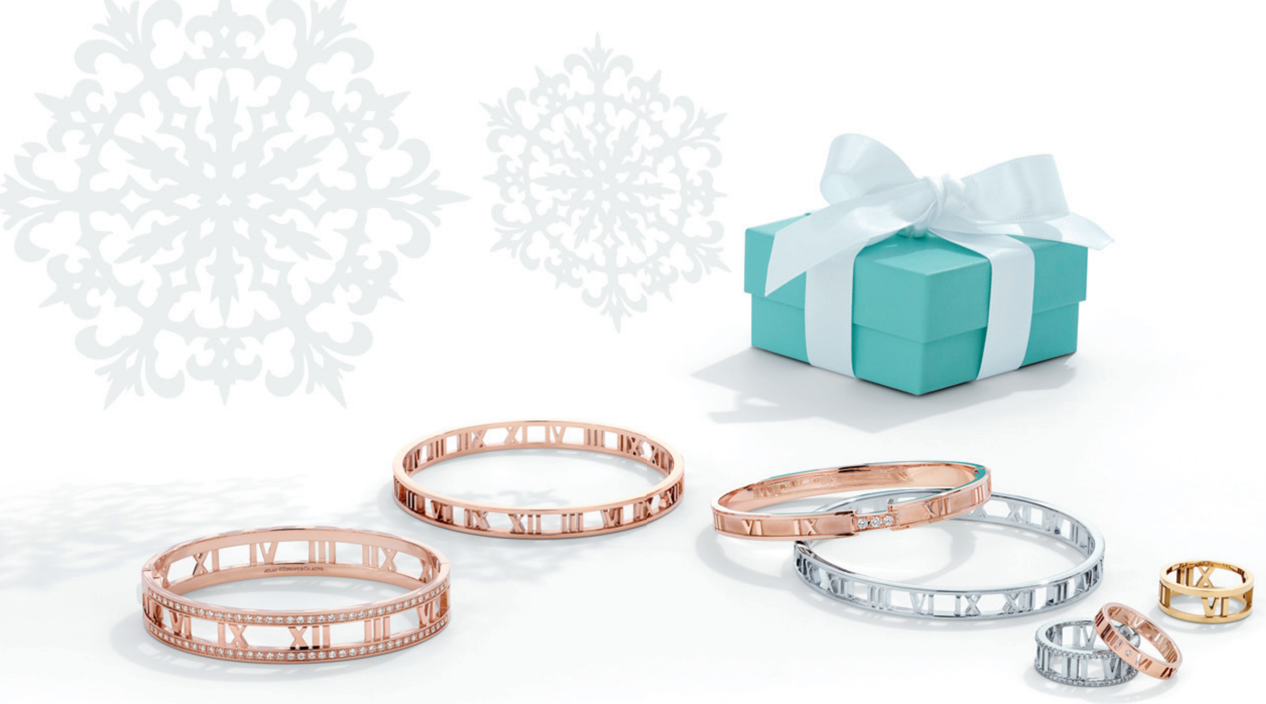
Atlas® designs, from left: Open-hinged bangle in 18k rose gold with diamonds, $11,000. Narrow open bangle in 18k rose gold, $3,500. Closed-hinged bangle in 18k rose gold with diamonds, $6,500. Narrow open bangle in sterling silver, $550. Open ring in 18k white gold with diamonds, $3,700. Narrow pierced ring in 18k rose gold with diamonds, $850. Open ring in 18k yellow gold, $900.