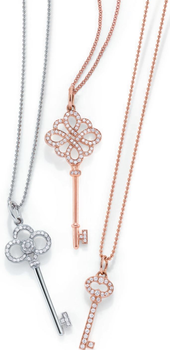
RIGHT Tiffany Keys pendants with diamonds, from left: Crown key in 18k white gold, $2,400. Knot key in 18k rose gold, $3,550. Mini vintage oval key in 18k rose gold, $2,000. Chains in 18k gold, from $225. Keys and chains sold separately.