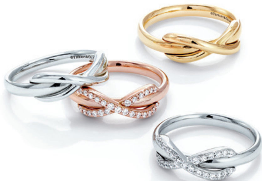
LEFT Tiffany Infinity rings, clockwise from top: In 18k yellow gold, $800. In 18k white gold with diamonds, $2,200. In 18k rose gold with diamonds, $2,200. In sterling silver, $275.