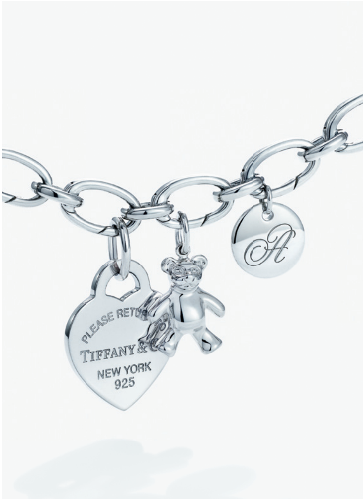
LEFT Charms in sterling silver. Return to Tiffany® heart tag, from $75. Teddy bear, $150. Tiffany Notes®, $75; all letters available. Oval link clasp bracelet, $625. Bracelet and charms sold separately. RIGHT Charms in sterling silver. Crown, $150. Tiffany Blue Box® with enamel finish, $250. Eiffel Tower, $175.