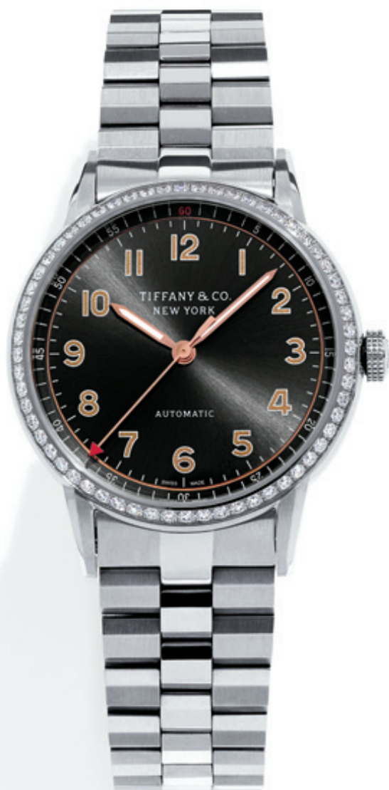
LEFT Tiffany CT60* 3-Hand 34 mm automatic watch in stainless steel with diamonds, Swiss-made, $8,750.