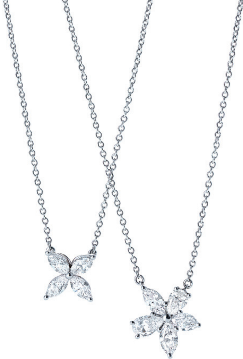
LEFT Tiffany Victoria™ designs in platinum with diamonds. Pendant, from $2,000. Mixed cluster pendant, from $4,900.