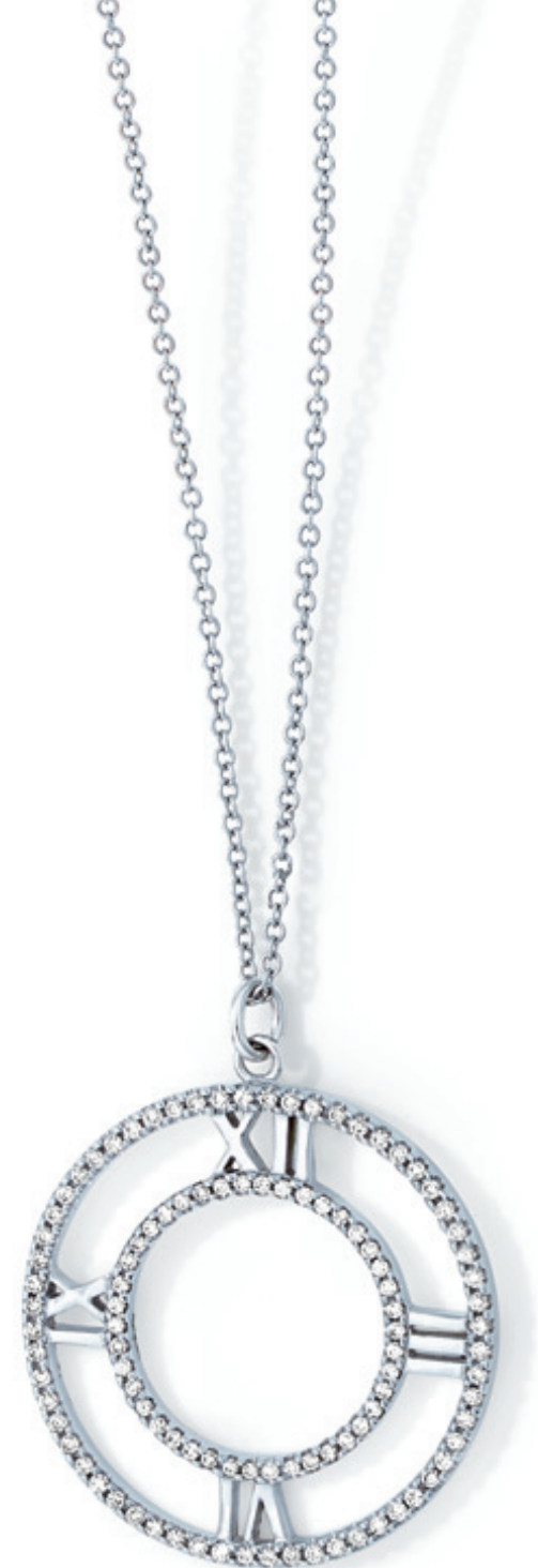
RIGHT Atlas® open pendant in 18k white gold with diamonds, from $2,350.