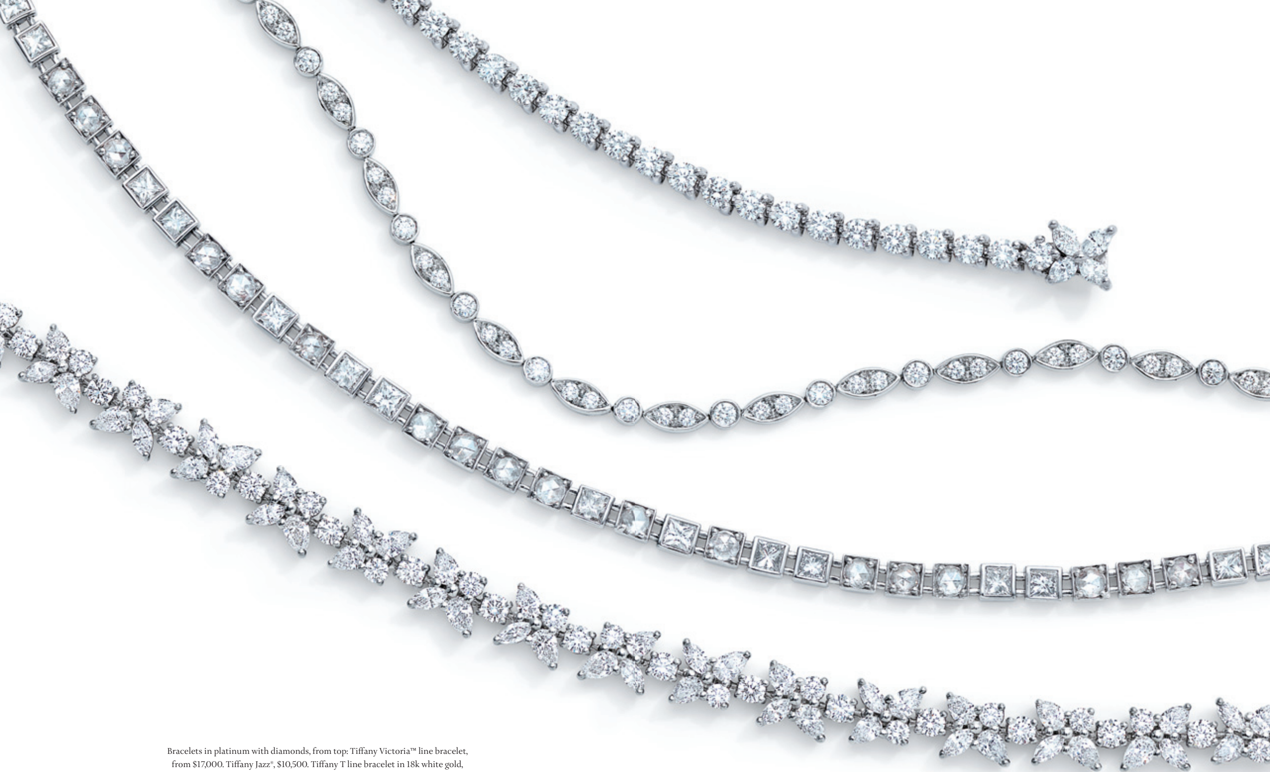
Bracelets in platinum with diamonds, from top: Tiffany Victoria™ line bracelet, from $17,000. Tiffany Jazz®, $10,500. Tiffany T line bracelet in 18k white gold, from $15,000. Tiffany Victoria™ mixed cluster bracelet, $45,000.