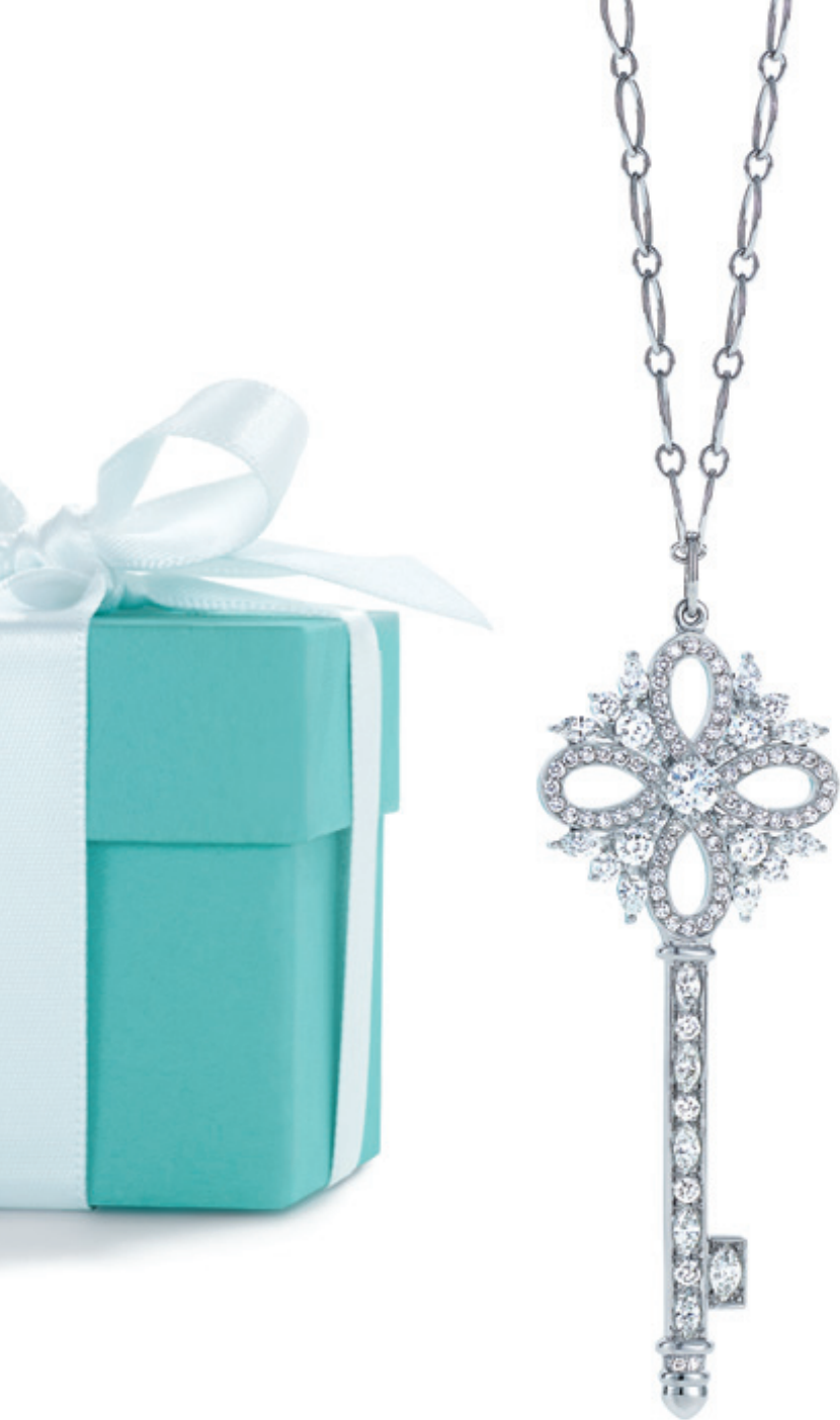
LEFT Tiffany Victoria™ key pendant in platinum with diamonds, $10,500. Oval link chain in 18k white gold, from $400. Key and chain sold separately.