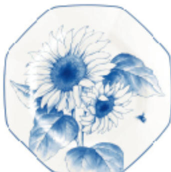
SUNFLOWER PLATTER/MEDIUM 13552401