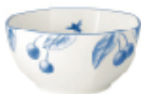
CHERRY SERVING BOWL/SMALL 13552355