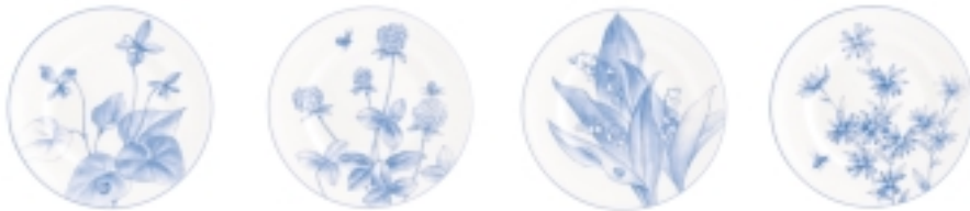
BREAD AND BUTTER PLATES: VIOLET, CLOVER, LILY, ASTRID SET OF FOUR 13552266