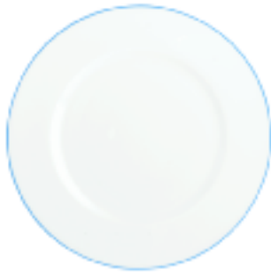
DINNER PLATE 13661421