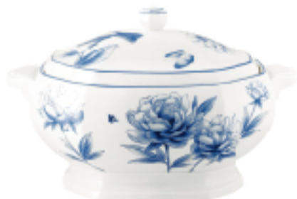
MAGNOLIA TUREEN 13552398