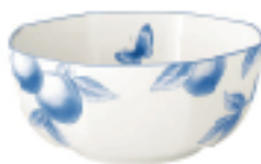
PLUM SERVING BOWL/MEDIUM 13552371