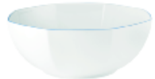
SERVING BOWL/MEDIUM 16032417