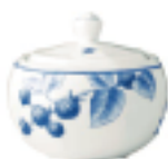
BLACKBERRY SUGAR BOWL 13552444