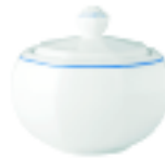
SUGAR BOWL 16032662