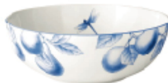
APPLE AND PEAR SERVING BOWL/LARGE 13552509