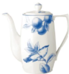
PLUM COFFEEPOT 13552479