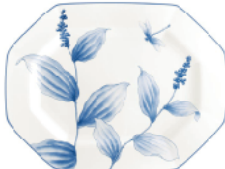
FALSE SOLOMON'S SEAL PLATTER/LARGE 13552428