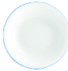
RIM SOUP BOWL 16032638