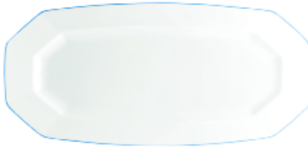
FISH PLATTER 16032344