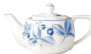
STRAWBERRY TEAPOT 13552487