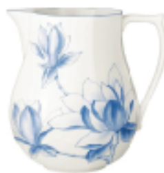
MAGNOLIA PITCHER 13552339