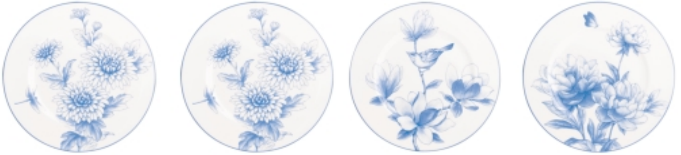
DINNER PLATES: CHRYSANTHEMUM, GERANIUM, MAGNOLIA, PEONY SET OF FOUR 13552223

Tiffany recommends a service for twelve and the serving pieces of your choice.