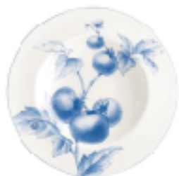
TOMATO RIM SOUP BOWL 13552304