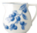
BLUEBERRY CREAMER 13552452